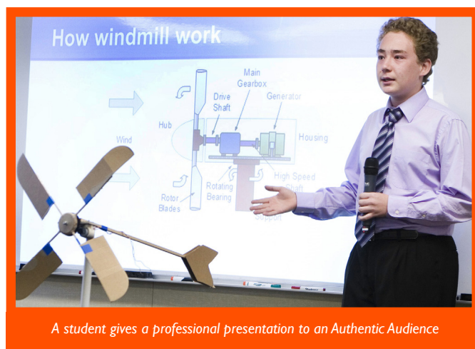
A student gives a professional presentation to an Authentic Audience