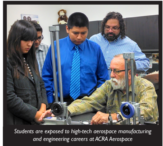
Students are exposed to high-tech aerospace manufacturing and engineering careers at ACRA Aerospace